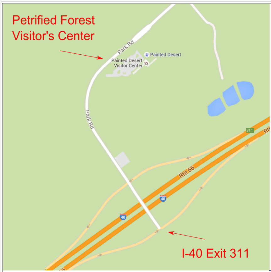
Petrified Forest National Park Visitor Center