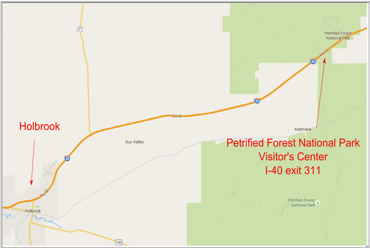
Holbrook to I-40 Exit 311

Click on a map below to open an equivalent Google map in a separate window.